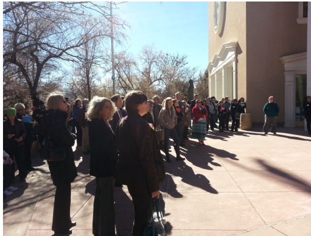
Coming up: NMCEH Lobby Day at the Capitol on January 26, 2023