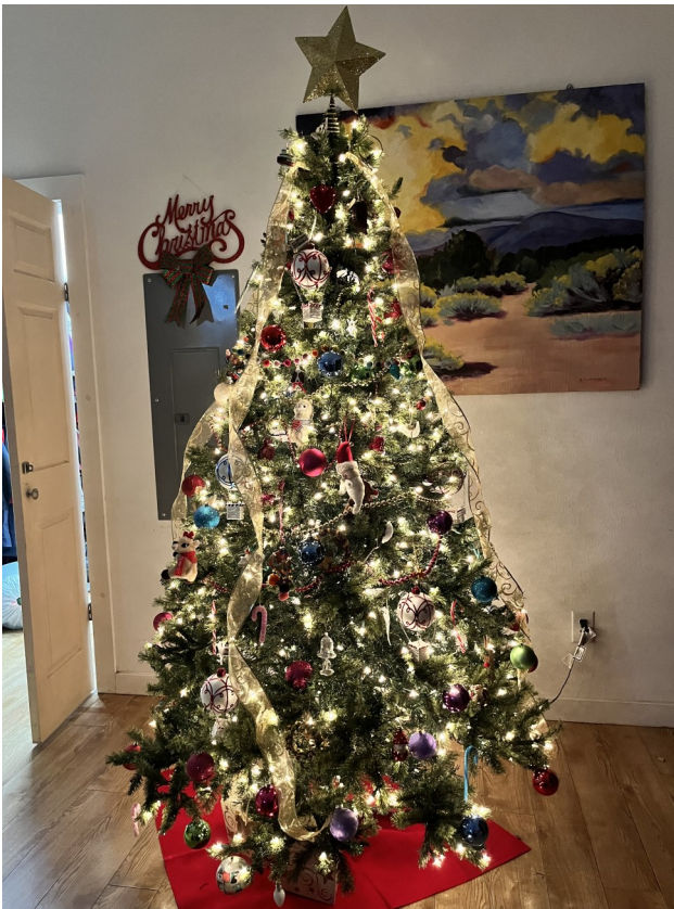
St. Elizabeth Shelter's Casa Familia Christmas Tree